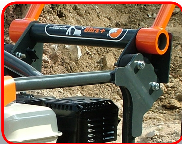
Unique Low HAV Mounting System