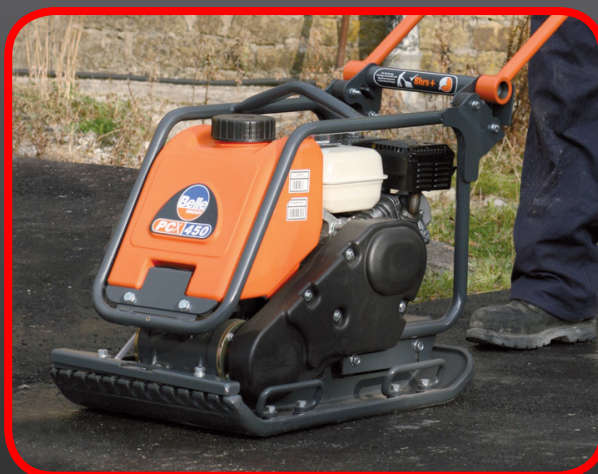
Water Kit & Spray Bar Option