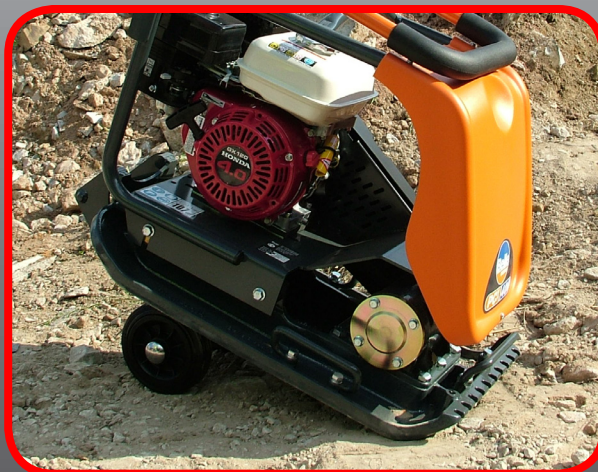
Wheel Kit Option