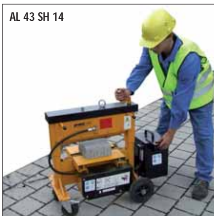
AL 43 SH 14

▶ AL 43 H 21 (with rigidly mounted carbide segment teeth) for blocks with difference in height of more than 4 mm.